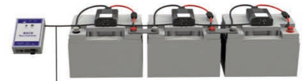
■ BACS BUS Interface „GX_R_AUX“